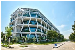
Business & Science Park Properties / Suburban Offices