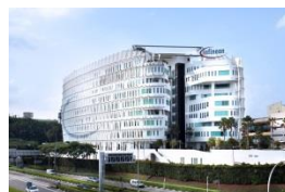
High-Specifications Industrial Properties and Data Centres