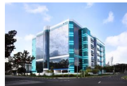
Light Industrial Properties and Flatted Factories