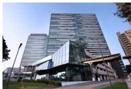
Integrated Development, Amenities & Retail Properties