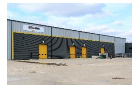
Logistics & Distribution Centres