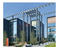
Farnborough Business Park, United Kingdom (50% interest)