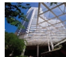
Central Park, Perth, Australia (50% interest)