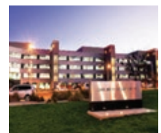
Caroline Chisholm Centre, Canberra, Australia