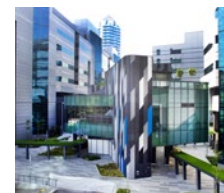
Alexandra Technopark, Singapore