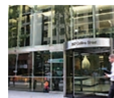
357 Collins Street, Melbourne, Australia