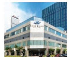
China Square Central, Singapore